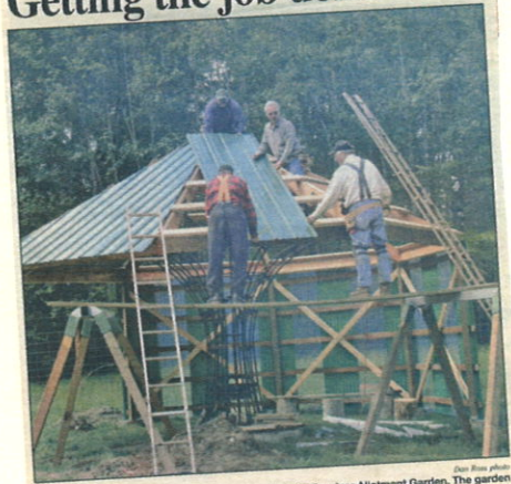
Volunteers work together to get the gazebo built at the Sunriver Allotment Garden. The garden is quickly becoming a favorite place for people to meet, plant seeds and reap the harvest of friendship and knowledge.

The community donated over $50,000 in kind for services and materials to make the garden happen. By early May close to 65 plots had been assigned and summer gardens were planted. Food Chi offered a number of workshops to help new gardeners get going. During the summer, walk-about were led by experienced Sooke gardeners, mentoring, to teach the gardeners best practices.